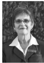
Elizabeth 8281 0638

St Patrick's Technical College Hooke Rd Edinburgh Nth Ph 8209 3700